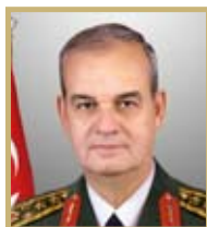
General Ilker Başbuğ Chief, Turkish General Staff