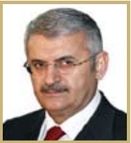
H.E. Binali Yıldırım, Minister of Transportation