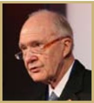
Brent Scowcroft , Chairman, Board of Directors, ATC