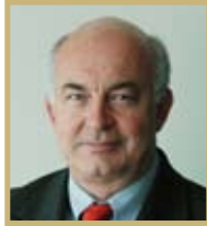
Dr. Kemal Derviş Vice President and Director, Global Economic and Development, Brookings Institution