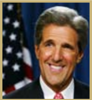
Senator John F. Kerry , Chairman, Senate Foreign Relations Committee, (D-MA)