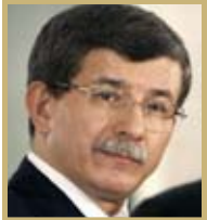
H.E. Dr. Ahmet Davutoğlu Minister of Foreign Affairs