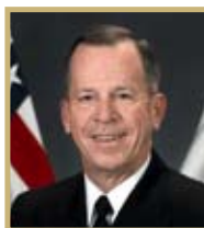
Admiral Michael Mullen Chairman, Joint Chiefs of Staff