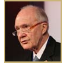
Brent Scowcroft, Chairman, Board of Directors, ATC