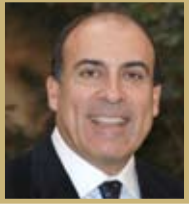
Muhtar Kent, Chairman of the Board & CEO, The Coca-Cola Company