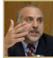
Soli Özel Department of Inter- national Relations and Political Science, Bilgi University