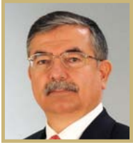
H.E. İsmet Yılmaz Minister of National Defense