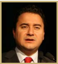
H.E. Ali Babacan

Deputy Prime Minister for Economic and Financial Affairs