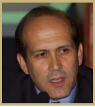
H.E. Ambassador Namık Tan Republic of Turkey Ambassador to the United States