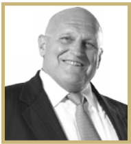
Ambassador Richard L. Armitage (Ret.) Chairman, Board of Directors, American-Turkish Council